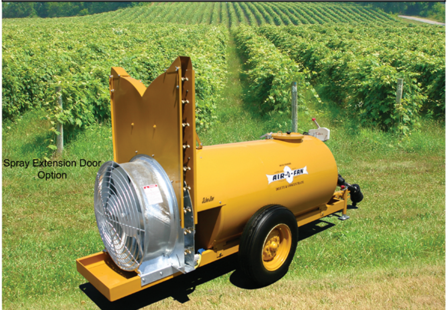
Spray Extension Door Option