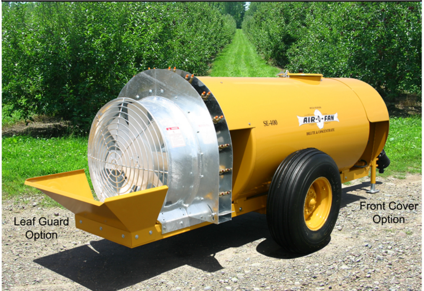
Leaf Guard Option