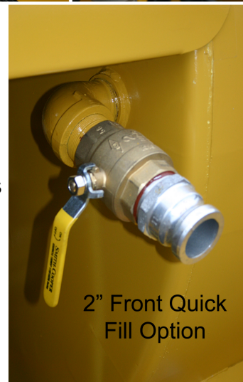
2" Front Quick Fill Option