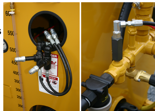
Dual Hydraulic Spray Valves