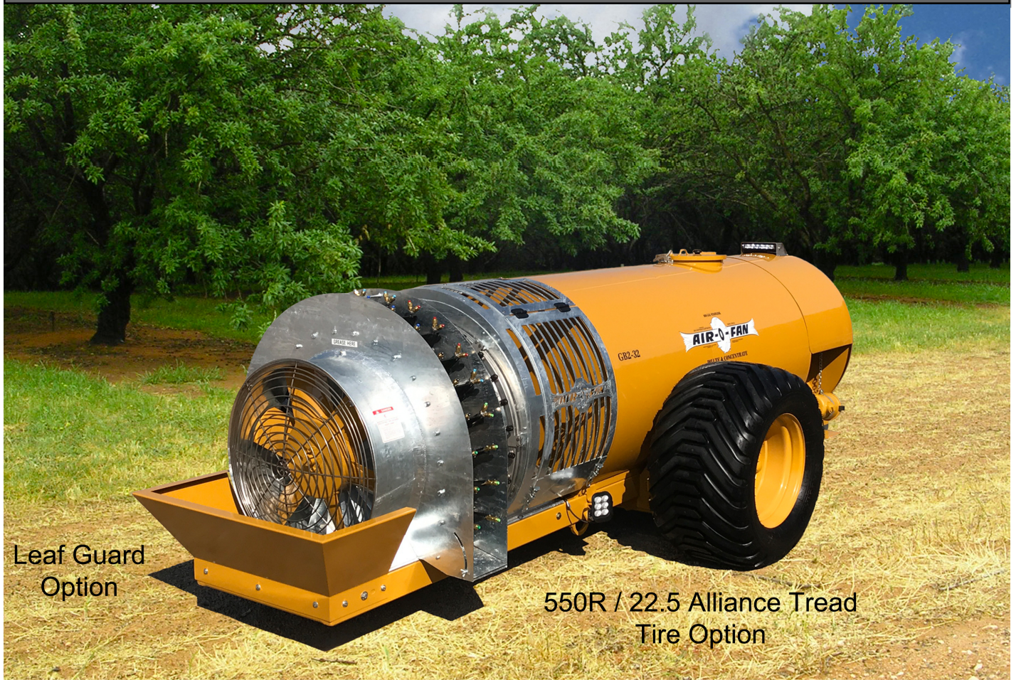
Leaf Guard Option