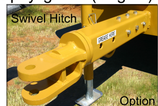
Option Swivel Hitch