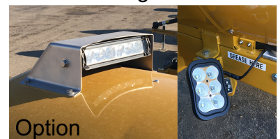
Option LED Spaylight kit (3 lights)