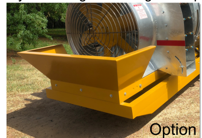
Option Fan Housing Leaf Guard